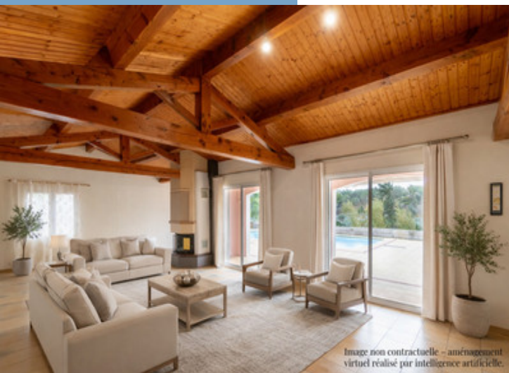
Image non contractuelle - aménagement virtuel réalisé par intelligence artificielle.